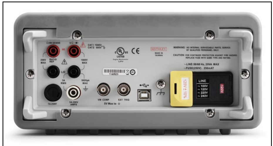
Model 2100 rear panel

AC CMRR: 70dB (for 1kΩ unbalance LO lead). POWER SUPPLY: 120V/220V/240V. POWER LINE FREQUENCY: 50/60Hz auto detected. POWER CONSUMPTION: 25VA max. DIGITAL I/O INTERFACE: USB-compatible Type B connection. ENVIRONMENT: For indoor use only. OPERATING TEMPERATURE: 5° to 40°C. OPERATING HUMIDITY: Maximum relative humidity 80% for temperature up to 31°C, decreasing linearly to 50% relative humidity at 40°C. STORAGE TEMPERATURE: –25° to 65°C. OPERATING ALTITUDE: Up to 2000m above sea level. BENCH DIMENSIONS (with handles and feet): 112mm high × 256mm wide × 375mm deep (4.4 in. × 10.1 in. × 14.75 in.). WEIGHT: 4.1kg (9 lbs.). SAFETY: Conforms to European Union Directive 73/23/ECC, EN61010-1, UL61010-1:2004. EMC: Conforms to European Union Directive 89/336/EEC, EN61326-1. WARRANTY: One year.