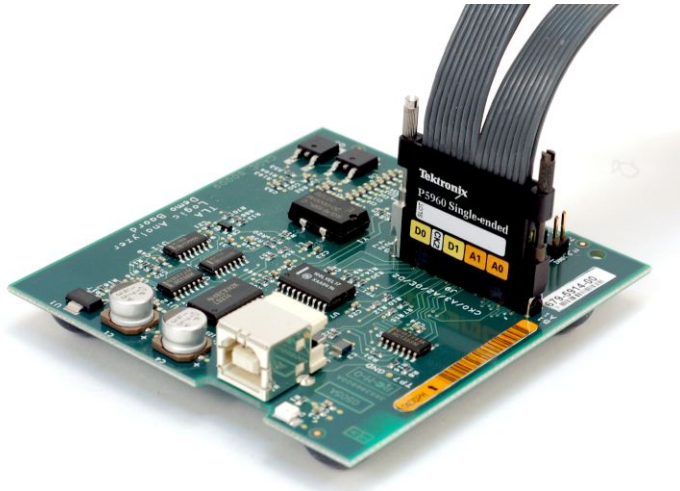
P5960 34-channel D-Max probe

For applications where circuit board space is limited, the 34-channel high-density P5960 D-Max offers the smallest available footprint and a quick connection mechanism.