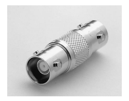
Figure 1: Model 237-TRX-BAR Three-Lug Triaxial Barrel Adapter

The Model 237-TRX-BAR is a 3-lug female triaxial barrel adapter. Each of the two connectors of the adapter mate to a standard 3-slot male triaxial connector.